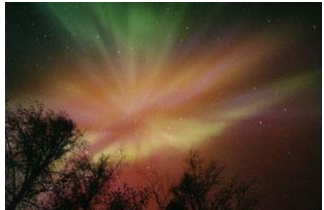
Solar flare (NASA image)

"We know it is coming but we don't know how bad it is going to be," Fisher told The Daily Telegraph. "It will disrupt communication devices such as satellites and car navigations, air travel, the banking system, our computers, everything that is electronic. It will cause major problems for the world. Large areas will be without electricity power and to repair that damage will be hard as that takes time.