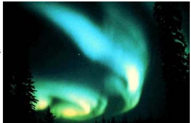
Solar flare