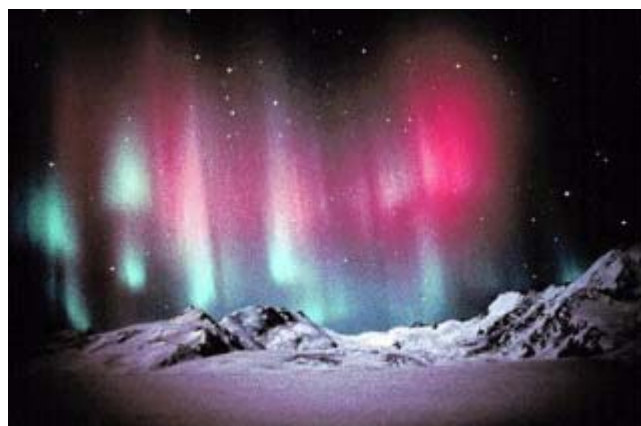
Solar flare

The video was speeded up to reveal four hours of actual time and some 70,000-80,000 miles of space. Analysts say the entire planet Earth could fit between the plasma streamers with room to spare.