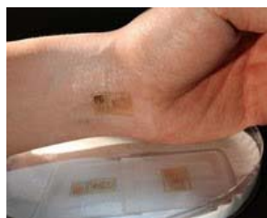
Skin Tattoo on the hand

I posted lots of good information about the 666 Surveillance System. It is all coming together like a gigantic jigsaw puzzle. Because of the prophetic word of God, we know what it is going to look like which it is not pretty.